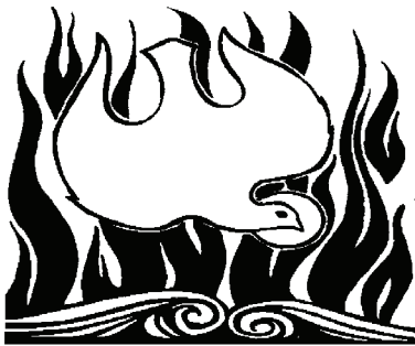
The Spirit of the Lord fills the world

Baby bottles are available at church entrances for this fundraiser. Please fill the bottle with any spare change you may have! The money collected will be used to support programs offered through Young Parent Support Program, which supports young families ages 15 - 25 and their children 0 - 6 years. Please return the bottles on Father's Day, June 17 th .